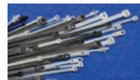
Cable/Zip Ties 50 & 120 Lbs - 100 pcs/bag