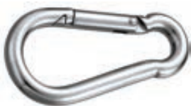
Zinc Plated Steel Snap Hooks #SH80ZP, #SH100ZP & #SH120ZP 100 pcs/ctn